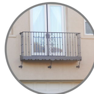
11. Balconies & Decks